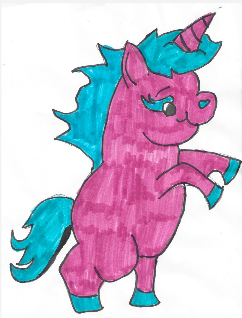
Original Artwork: Delaney Bazydlo