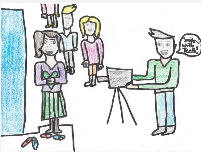
Artwork By: Madison Gilbert

Smile! Spring pictures are around the corner. I know some of you may not like picture day, but I bet some of you do. But I mean come on, some parents don't even buy pictures! If your parents do buy pictures you have to look PERFECT . Although some of you may dislike picture day people have other opinions with other reasons. Students may think of picture day as an opportunity to look their very best. Some students may like dressing up for picture day. As you can see there are different opinions supporting both arguments