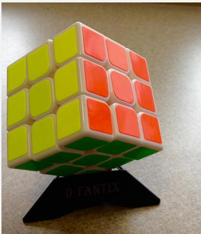
(Rubik’s Cube)