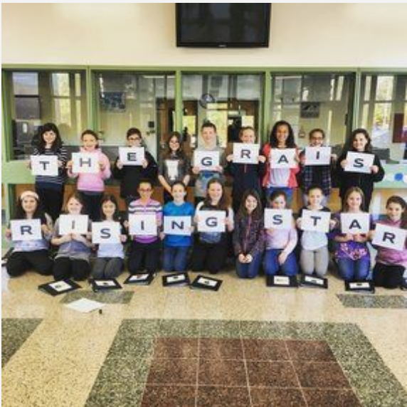
The whole team.

We are a group of twenty, dedicated students from 4th and 5th grade at GRAIS. Our positions range from journalists and photographers, to cartoonists, editors, page designers and collaborators. We meet monthly to brainstorm the happenings in and around our school and report out on topics we feel our readers will be most interested in.