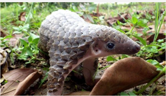
Above: Tree pangolin

If you want, go to Wild Kratts Pangolin Rescue and find out more about pangolins. If you want to go to Amazon and buy the Wild Kratts Defender Set it comes with a Chinese Pangolin and a yellow pangolin disc. Now you have a great defense! I hope you liked learning all about pangolins.