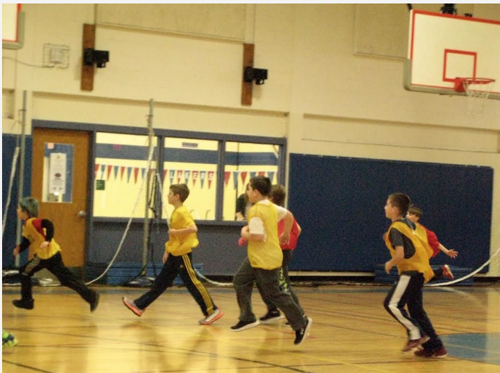
Above/Below: 4th graders playing handball after school.

If you are thinking of joining, take my advice, stop thinking and join!