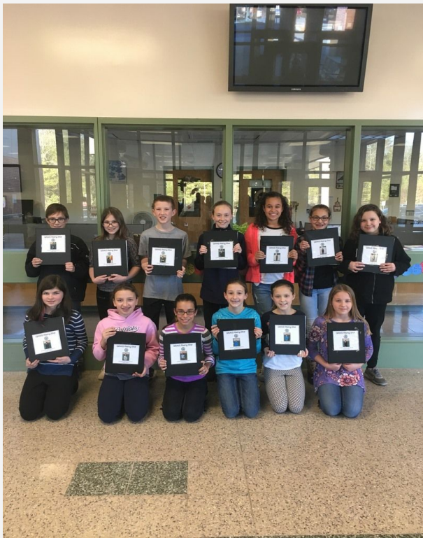
5th grade team