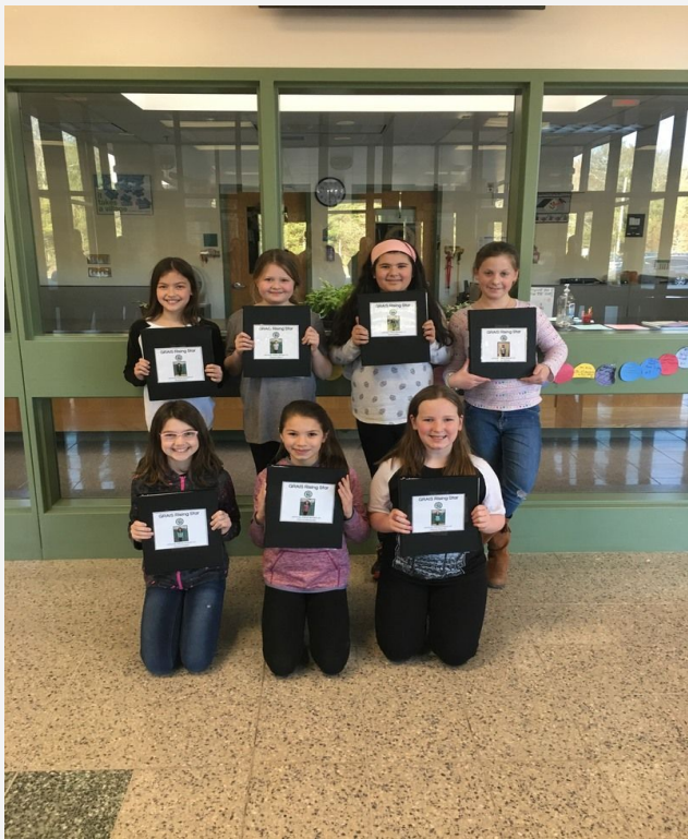
4th grade team