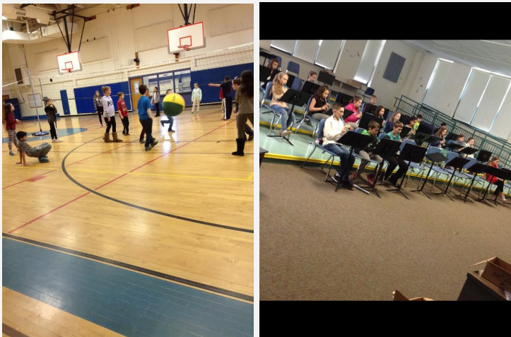
Above: Students play volleyball in gym and practice recorders in music