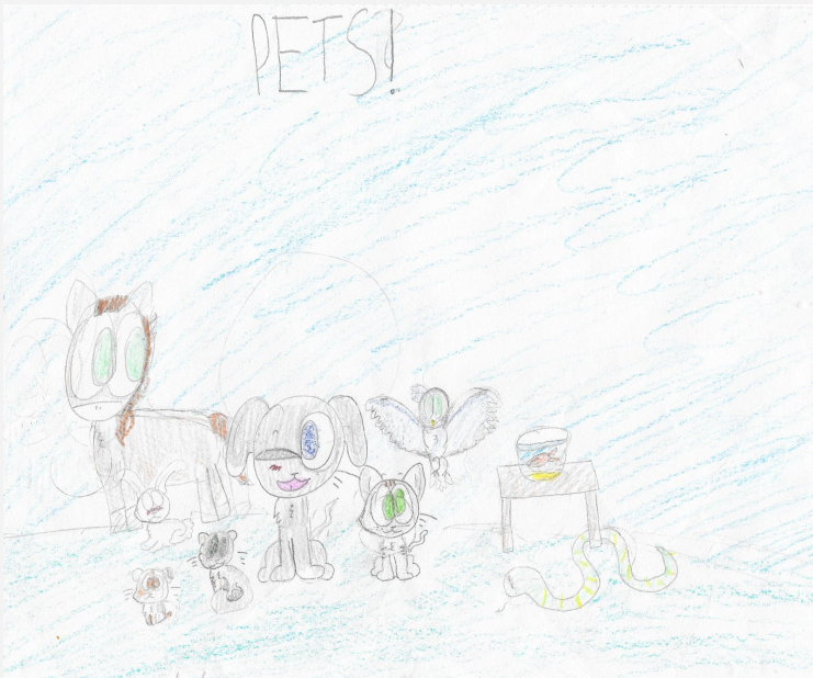
Artwork By: Lily Svirtunas

So many to choose from! Dogs, cats, bunnies, birds. Which one would you choose for a pet? In a survey of 27 students, 16 students voted for dogs, 4 for bunnies, 2 for ferrets, and 3 for cats, and Guinea pigs and turtles tied with 1 vote each. When you walk in the pet store which animal would you run to? There are more than what we gave for options such as snakes, mice, rats, chinchillas, lizards and frogs. A fun fact about a dog is that they see in black and white. Did you know that Guinea pigs are social animals and it is better to adopt them in pairs. Female rabbits are called doe and male rabbits are called buck. Another fun fact is that cats have about 130,000 hairs per square inch. Another pet you might have are ferrets. A group of ferrets is called a business. (continued on the right) →