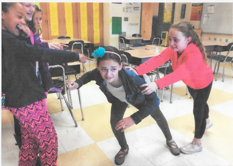
Above: 4th grade students act out an example of bullying in school

It is a subject that is common. It has been watched before many of your own eyes. It is usually ignored by us students, but not in the way that is wanted or recommended. Take a moment and think. ( Even if you have probably read the title of this article, think anyway.) Have you figured it out yet? Probably not. You’re just trying to read this article.